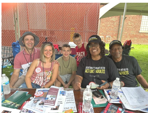
Our NEO team volunteer directors and prayer leaders at "The Fest" promoting the Cleveland event coming in October & praying with couples all day. Tens of thousands in attendance!