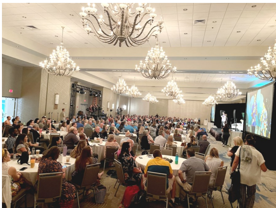
FamilyLife Staff conference in July in Orlando

Life change is not about numbers. We are so grateful for every new believer at our Weekend to Remember events! The angels in heaven rejoice!!!