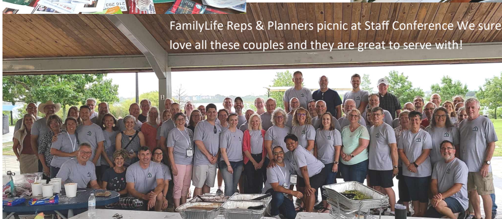
FamilyLife Reps & Planners picnic at Staff Conference We sure love all these couples and they are great to serve with!