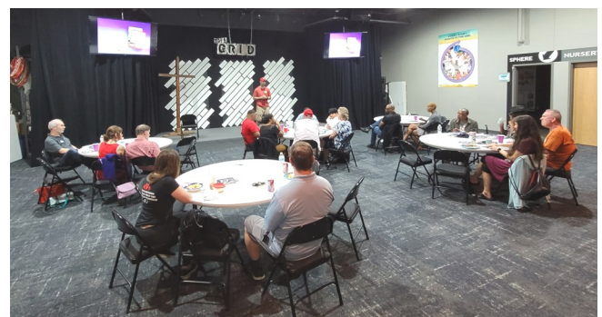
NE Ohio team from this past weekend. We were very humbled when they prayed over us. We sure love our teams!